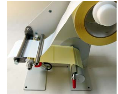
Label Threading Path

OPTIONAL LABEL COUNTER: The optional Label Counter will add one count to the displayed number for each label that is dispensed. This Option is available only factory installed in new units.